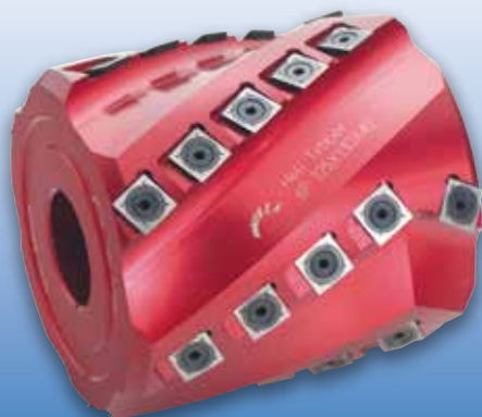
"Heli Timber" Planer head

3 to 5 times longer lifetime than uncoated tools. Long-lasting sharp cutting edge and better cut surface.